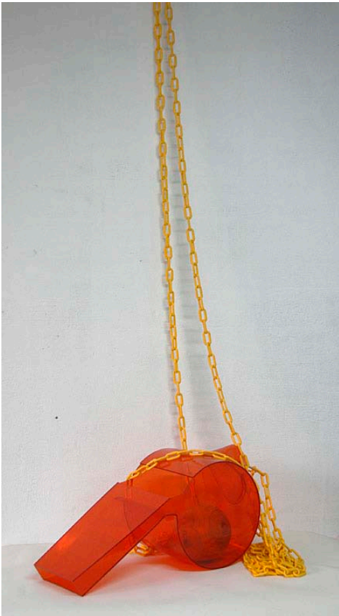
red whistle (2011) 70 x 26x 30cm • acrylic & wood